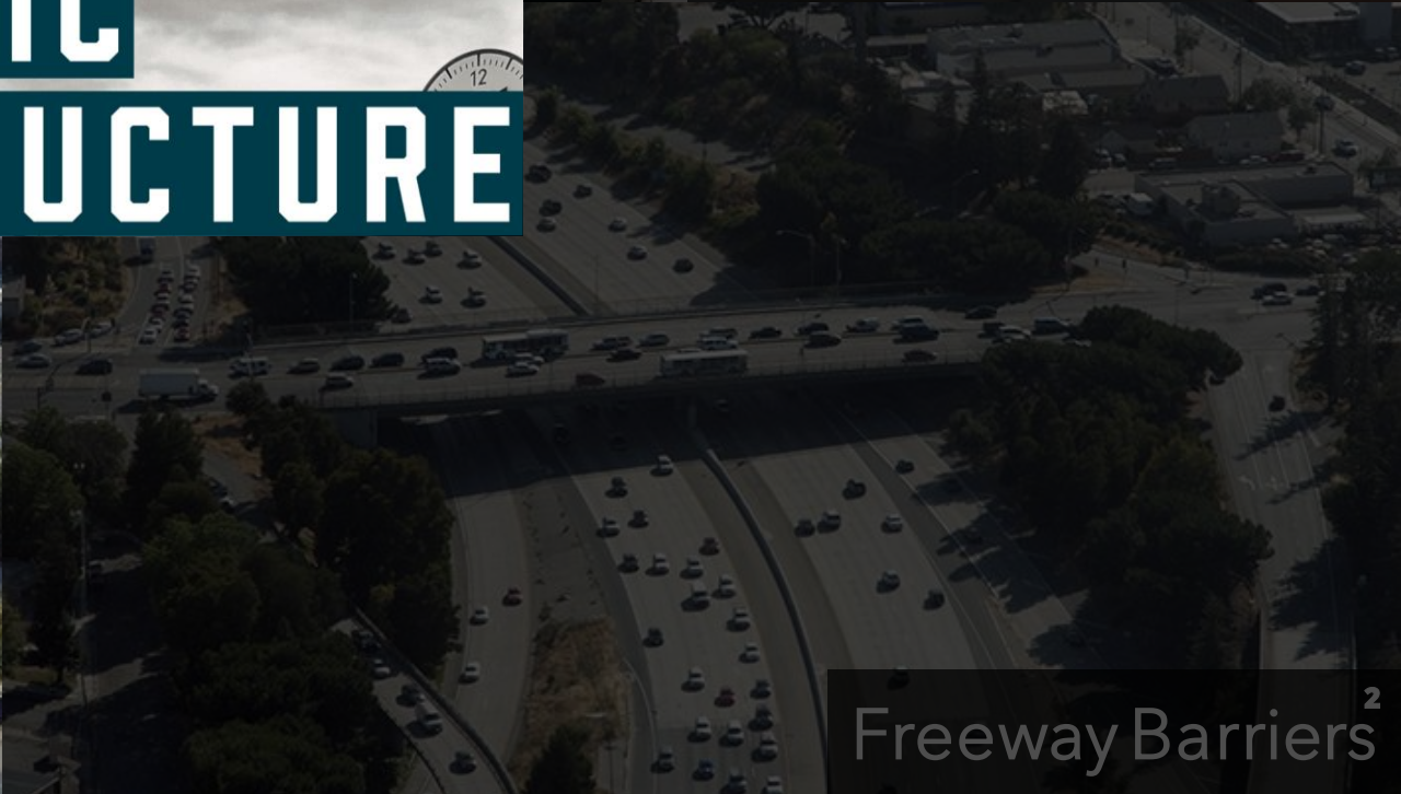
Freeway Barriers 2