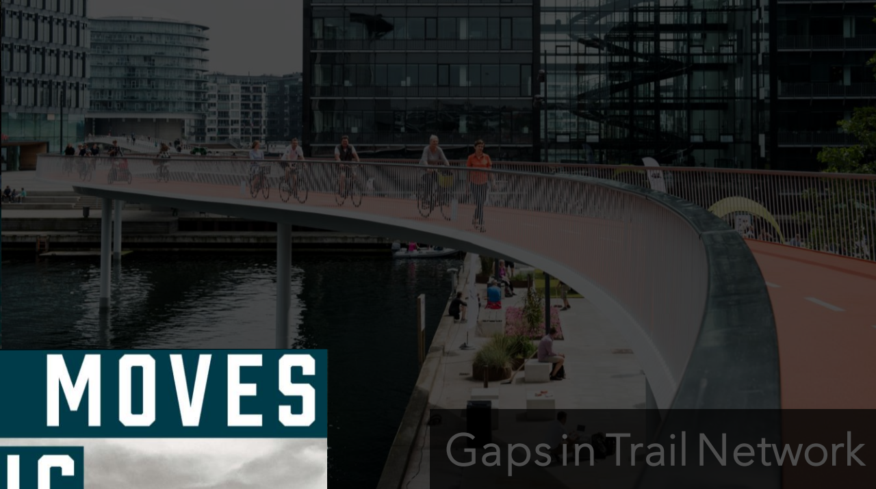
Gaps in Trail Network