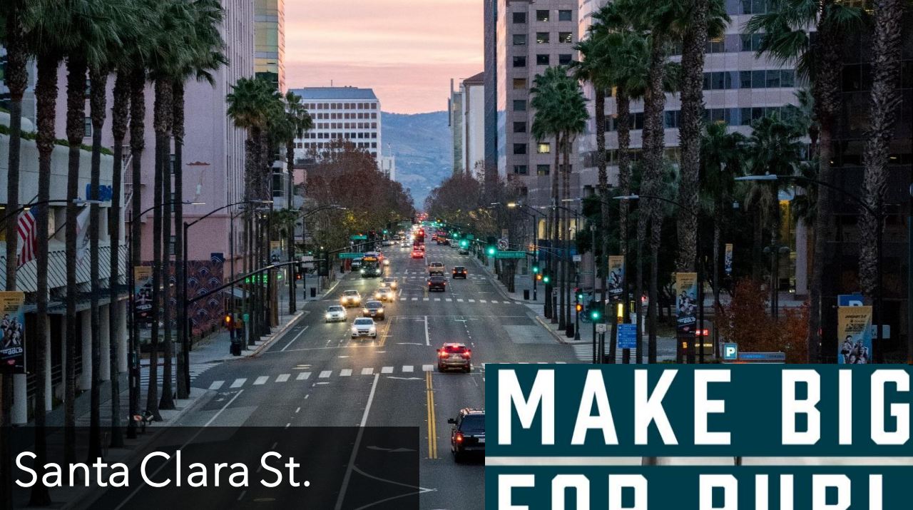
Santa Clara St.