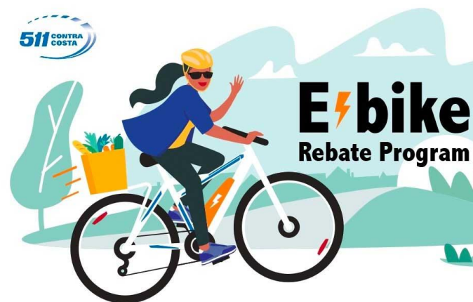
Affordability & Access