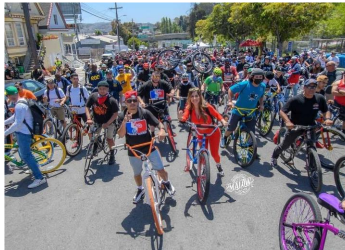
Events & Celebrations