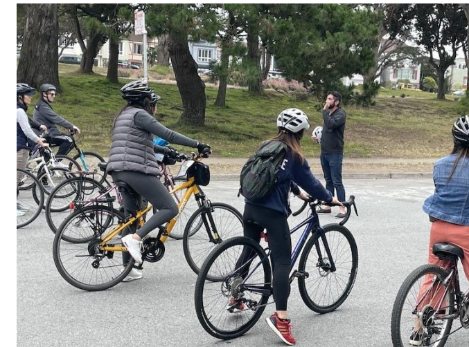
Education & Enforcement