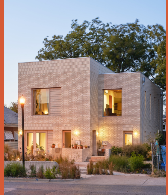
Alumina Apartments Sam Day Architect + Developer