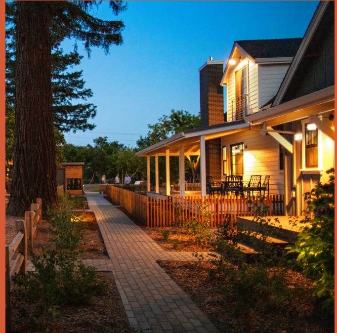
RiverHouse CRAFT DnA Developer