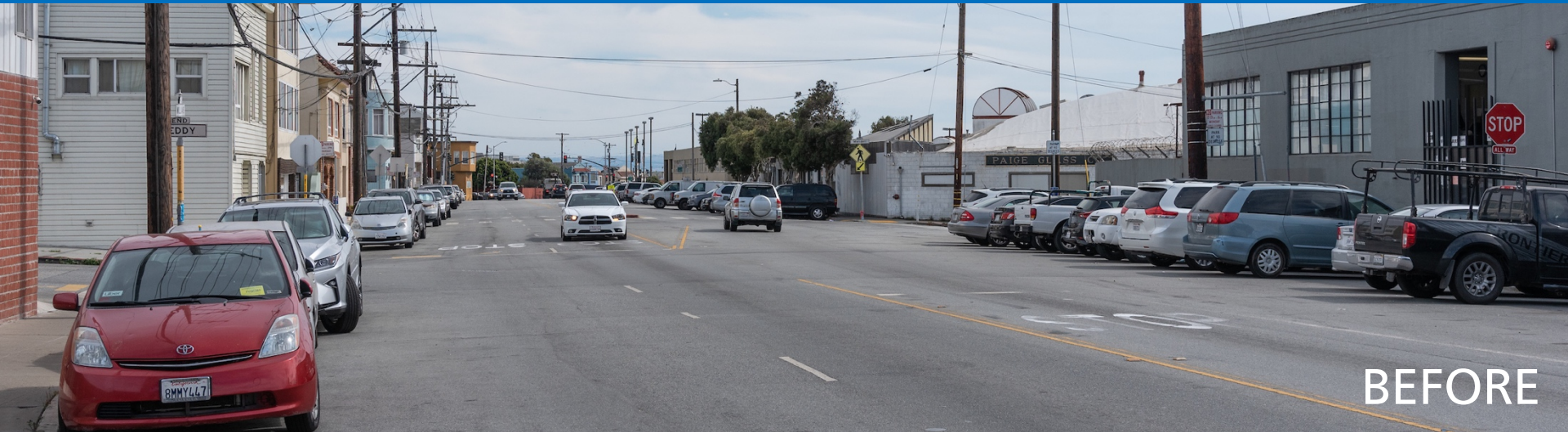
Painted Safety Zones