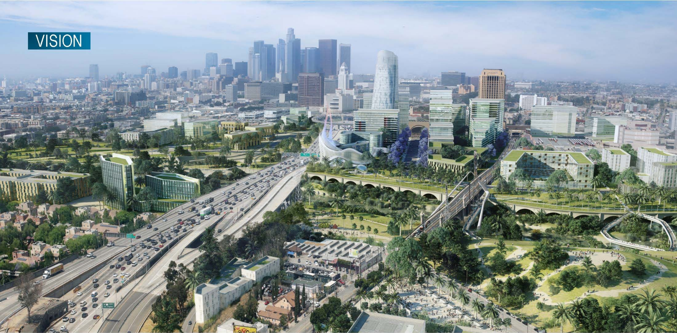
PROPOSED MIX-USE DEVELOPMENT LOOKING WEST THROUGH UNION STATION