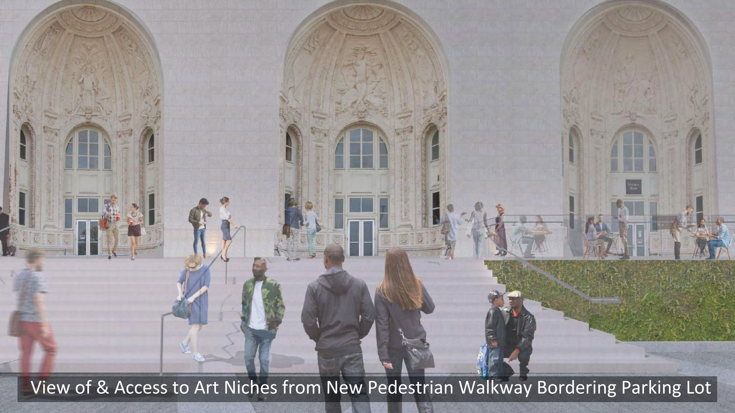
View of & Access to Art Niches from New Pedestrian Walkway Bordering Parking Lot