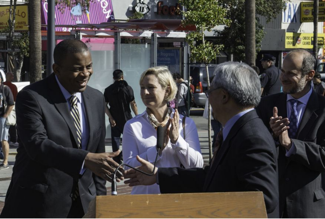
Secretary Foxx, federal funding announcement press conference.