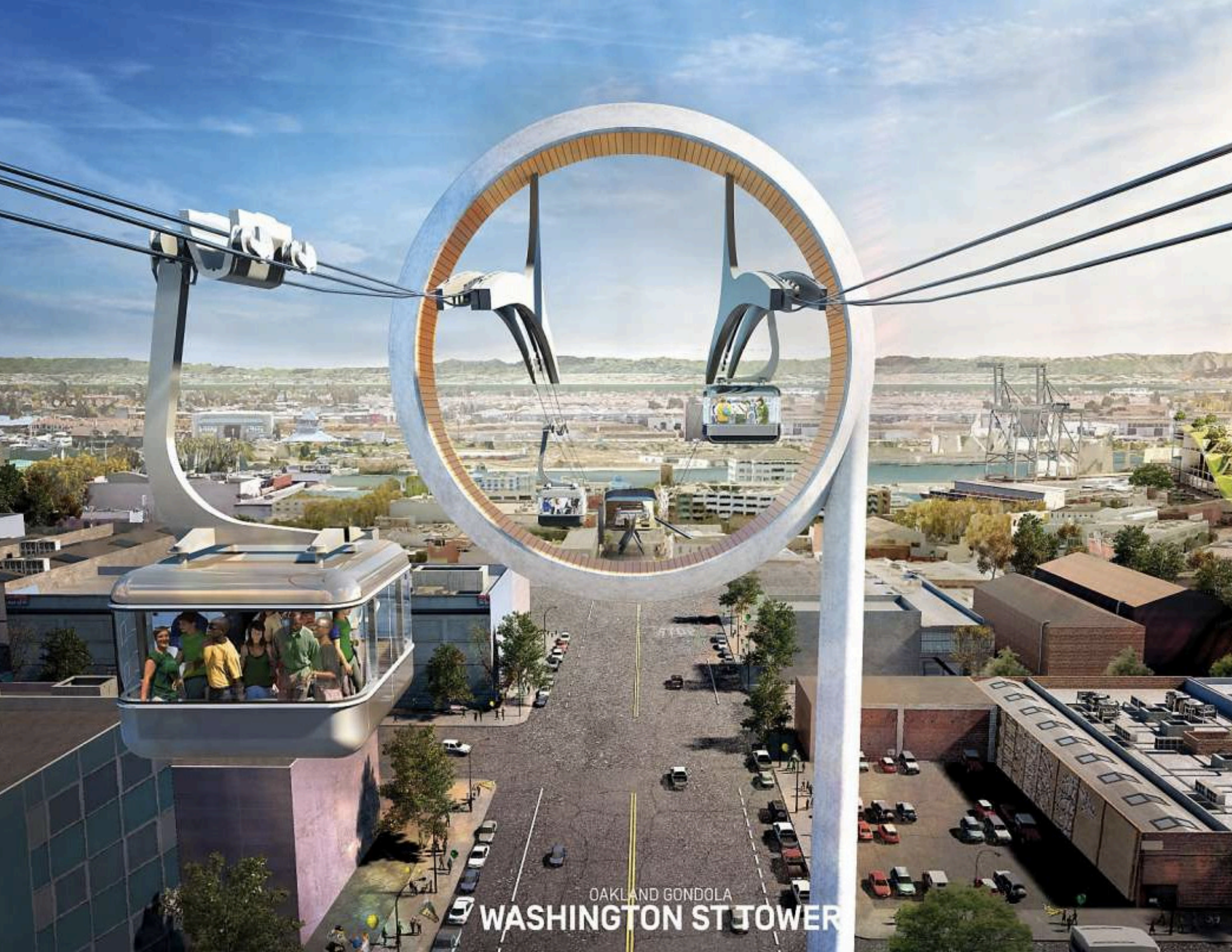
OAKLAND GONDOLA WASHINGTON ST TOWER