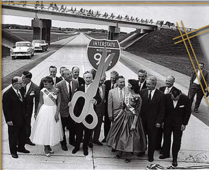
Ribbon-cutting ceremony along the first portion of Interstate highway to be completed in Wisconsin on September 4, 1958—I-94 in the Waukesha area.