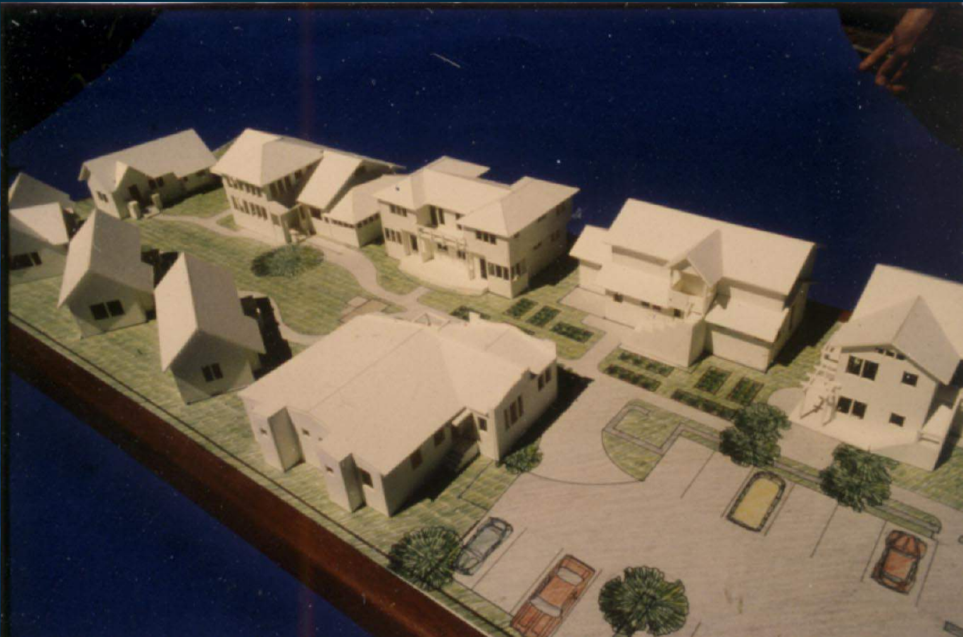
BERKELEY COHOUSING completed 1997