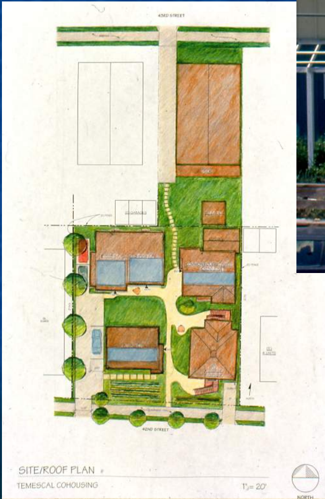
TEMESCAL COMMONS, OAKLAND, CA Completed 2000