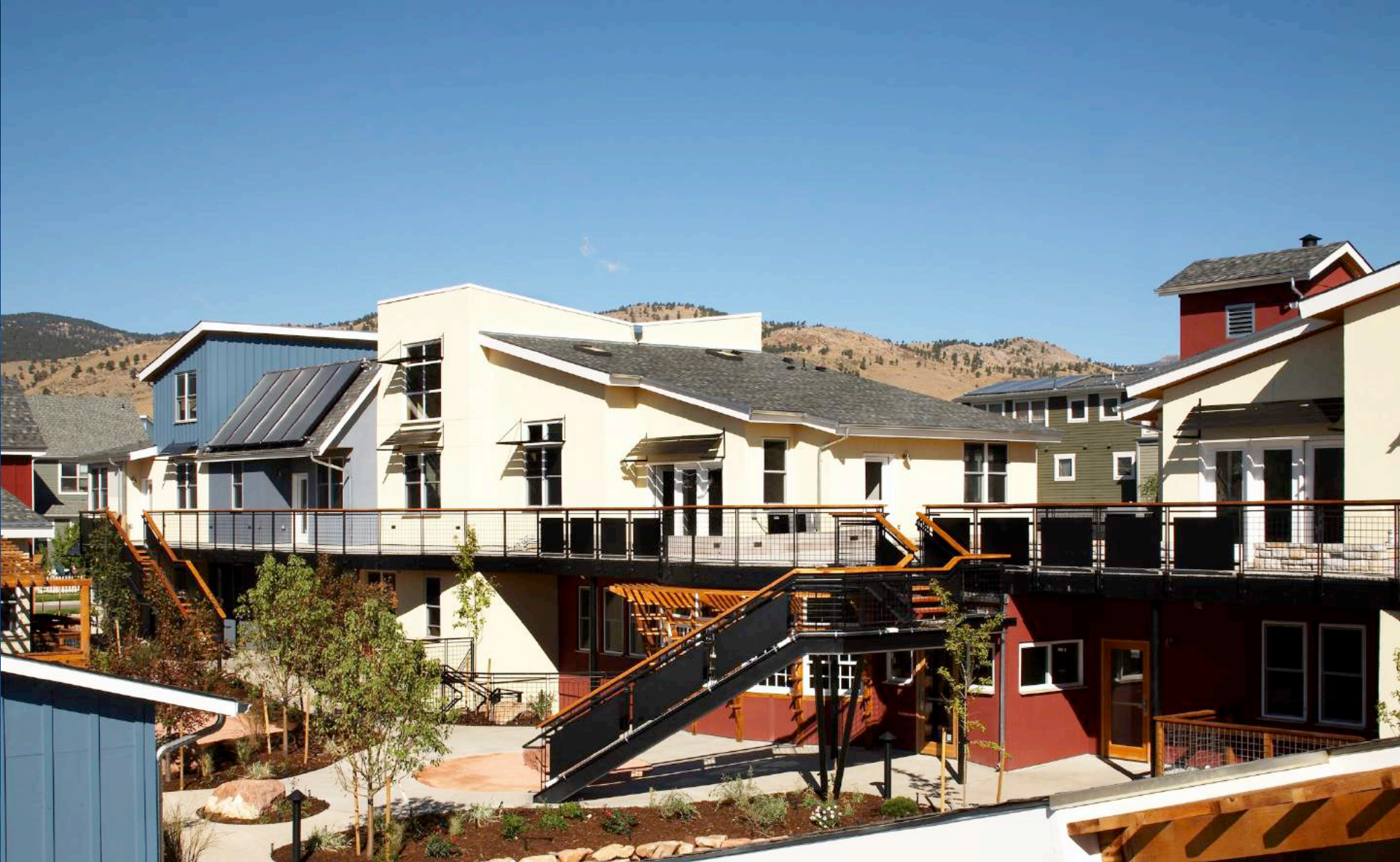
SILVER SAGE, BOULDER, COLORADO 2007 16 Units