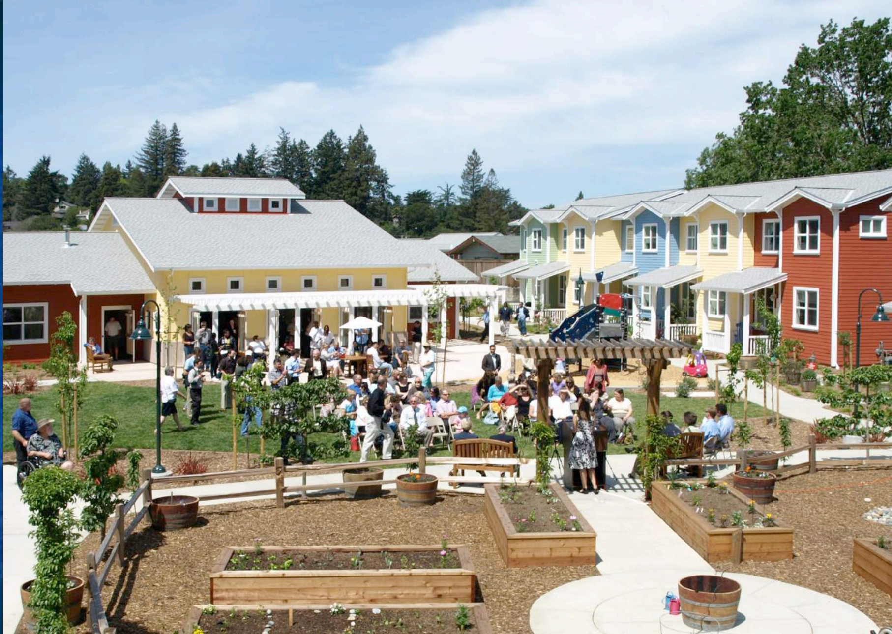
Petaluma Avenue Homes in Sebastopol - Affordable Rentals