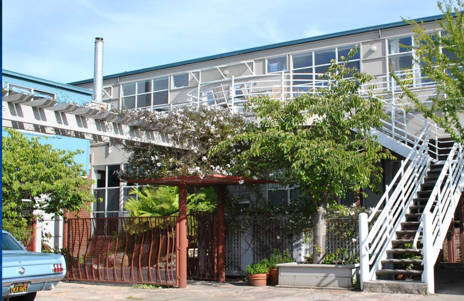
DOYLE STREET COHOUSING, EMERYVILLE Completed 1992