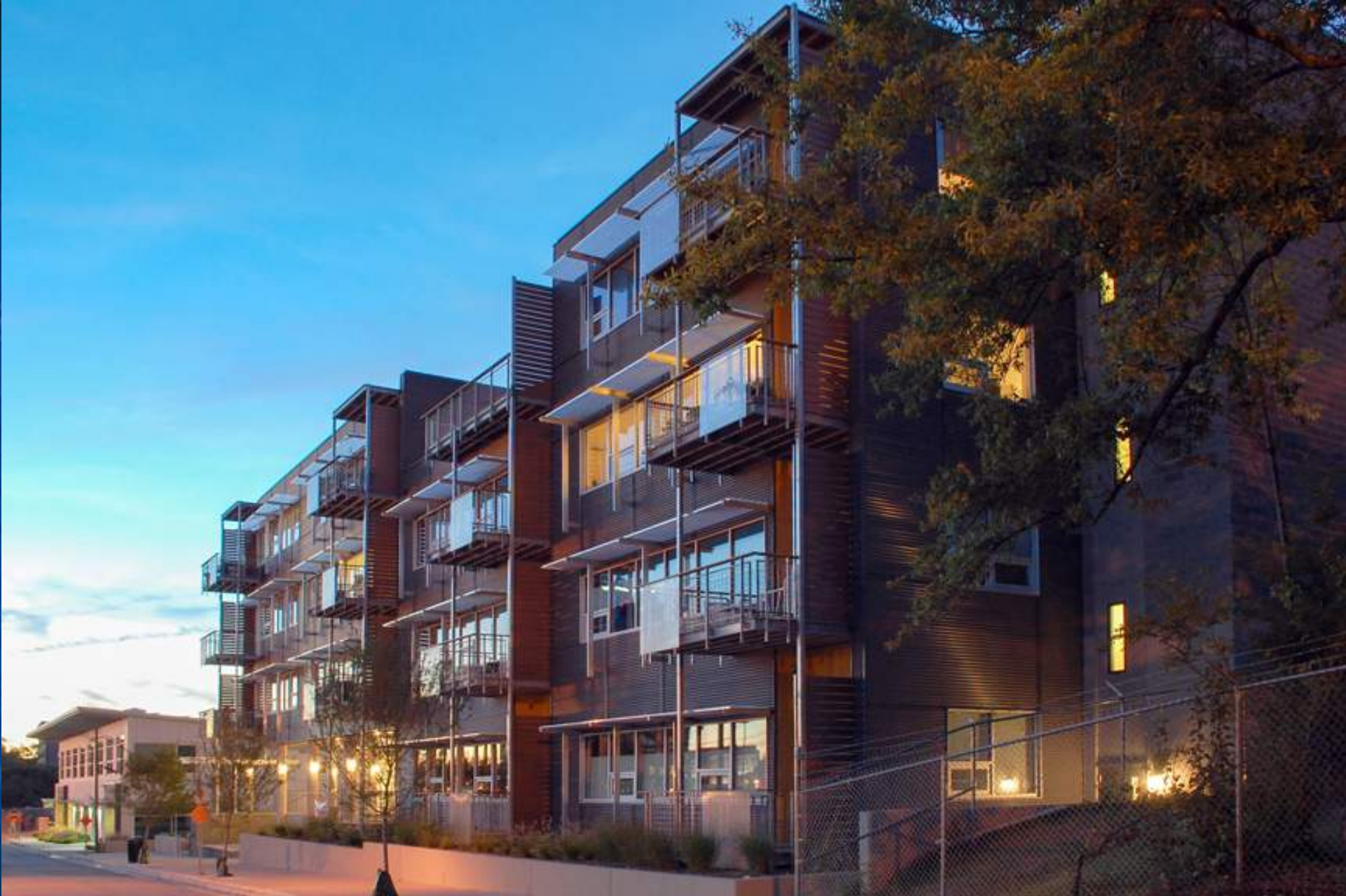
CENTRAL PARK COHOUSING, DURHAM, NC