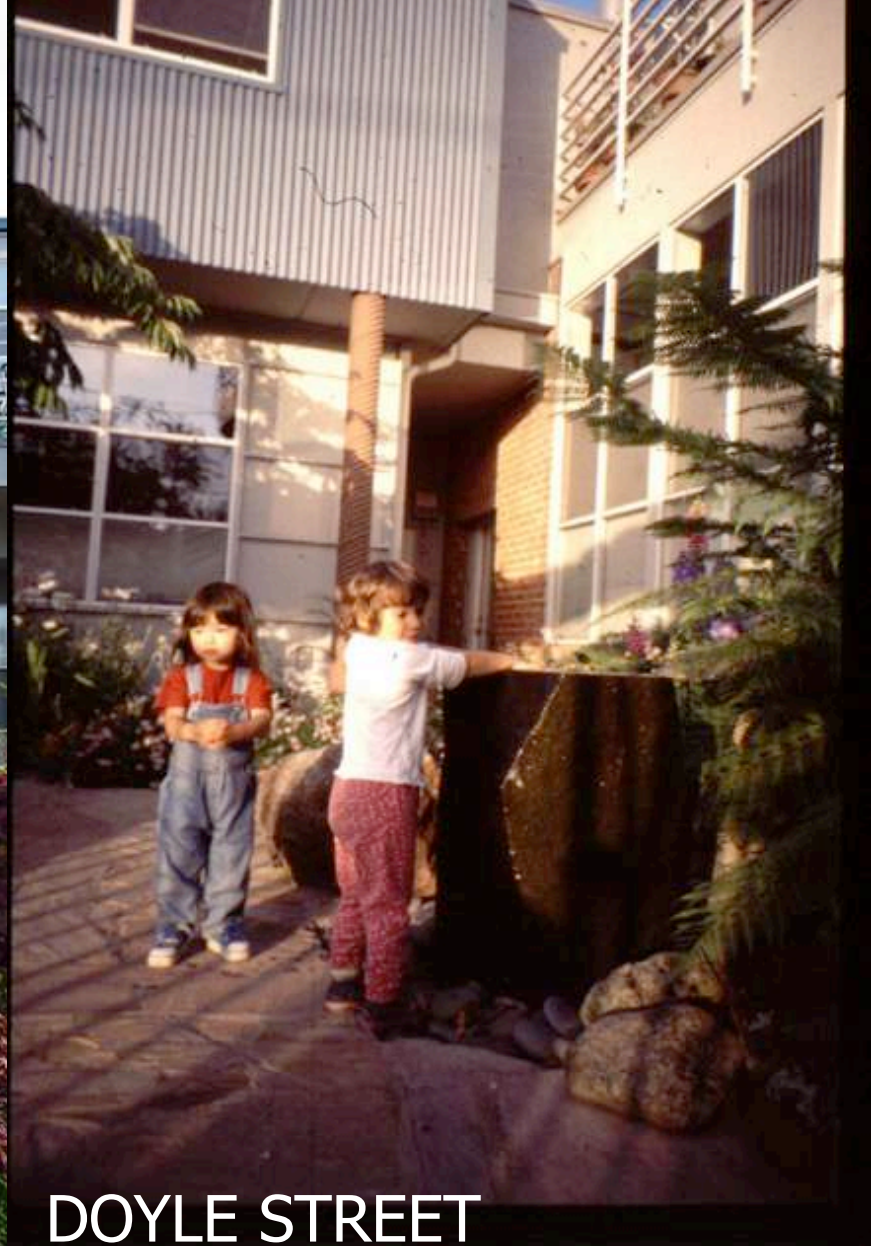
DOYLE STREET COHOUSING Completed 1992