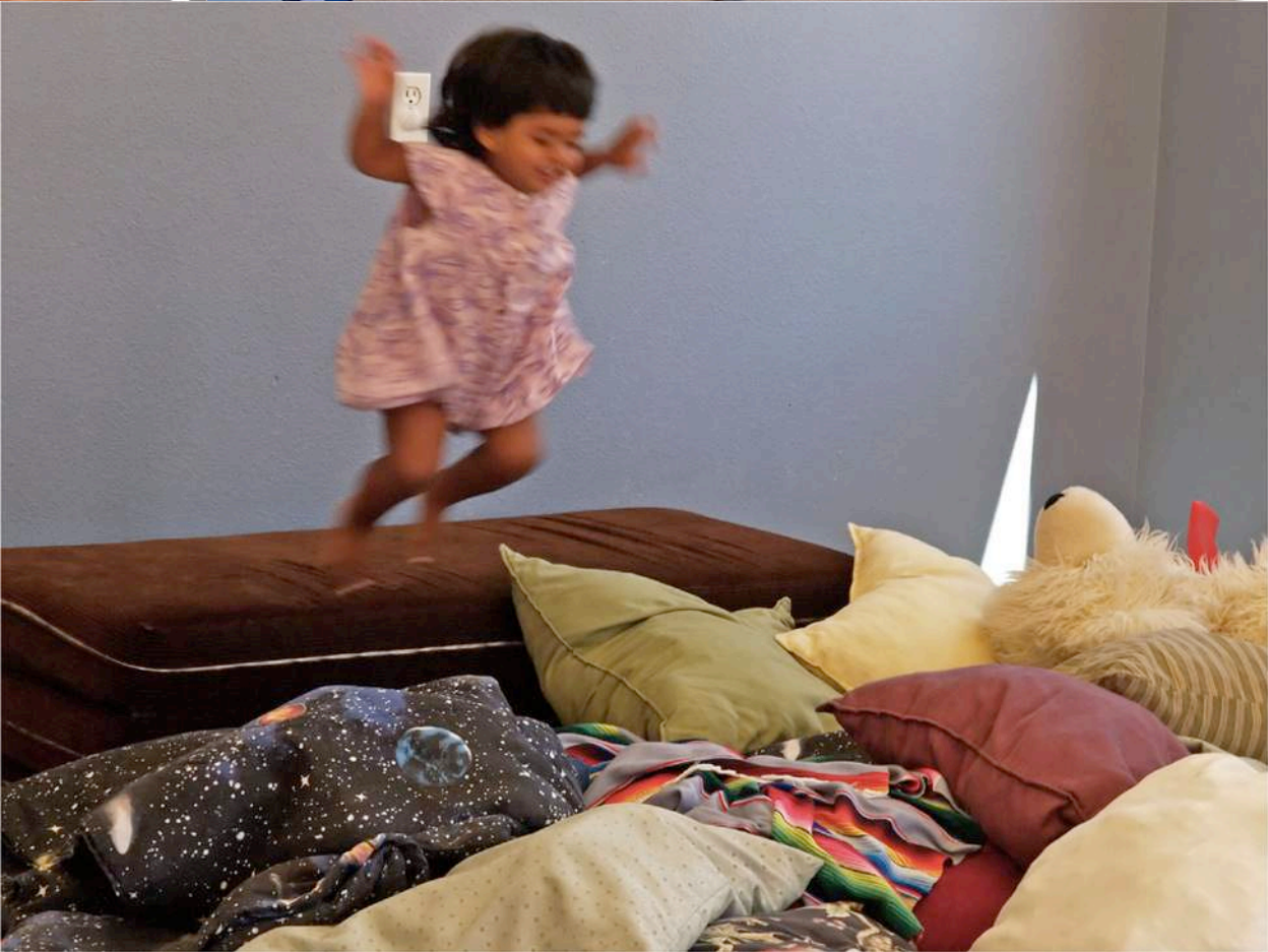
KIDS PLAY ROOM