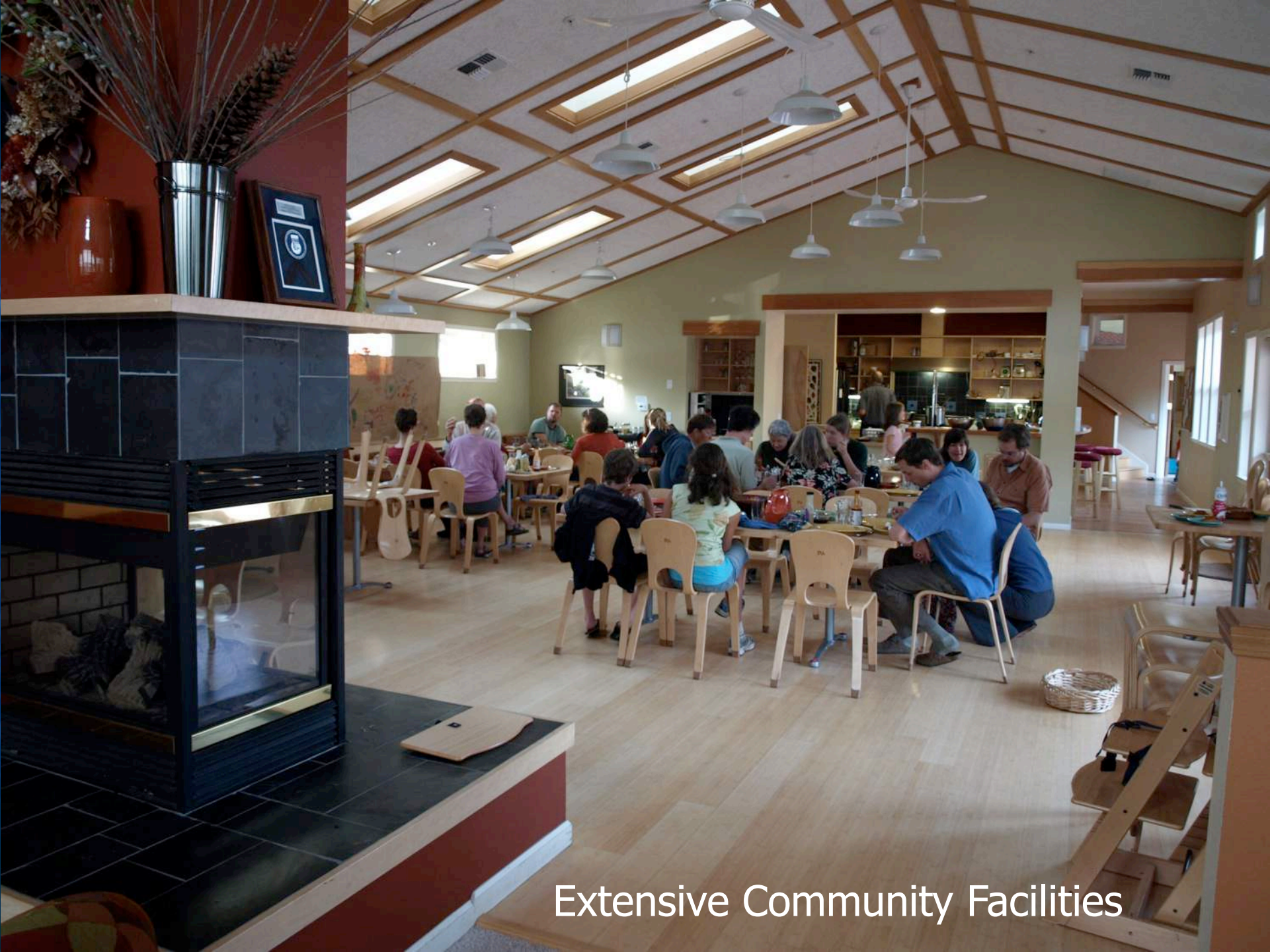
Extensive Community Facilities