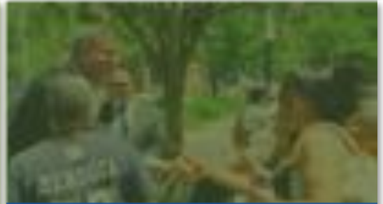
Neighborhoods & Community