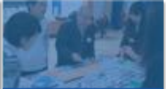
Thought Leaders & Universities