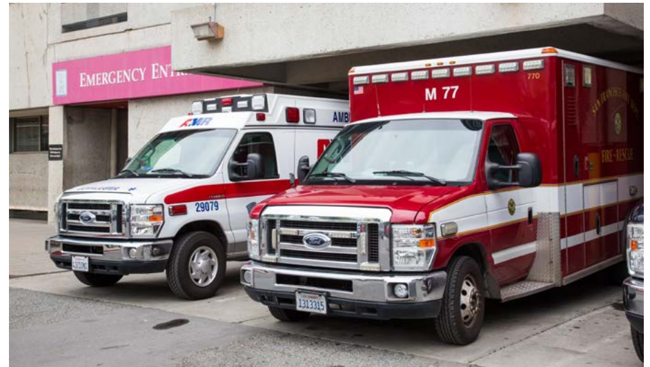
Ambulances parked at the emergency entrance to San Francisco General Hospital, Building 5. A portion of the bond money in Prop. A would go to rehabilitating Building 5.

Transparency and accountability standards are built into the measure, including independent annual reviews, audits and reports to the Citizens' General Obligation Bond Oversight Committee. This bond would not increase local property tax rates.