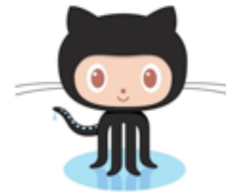
public policy + tech