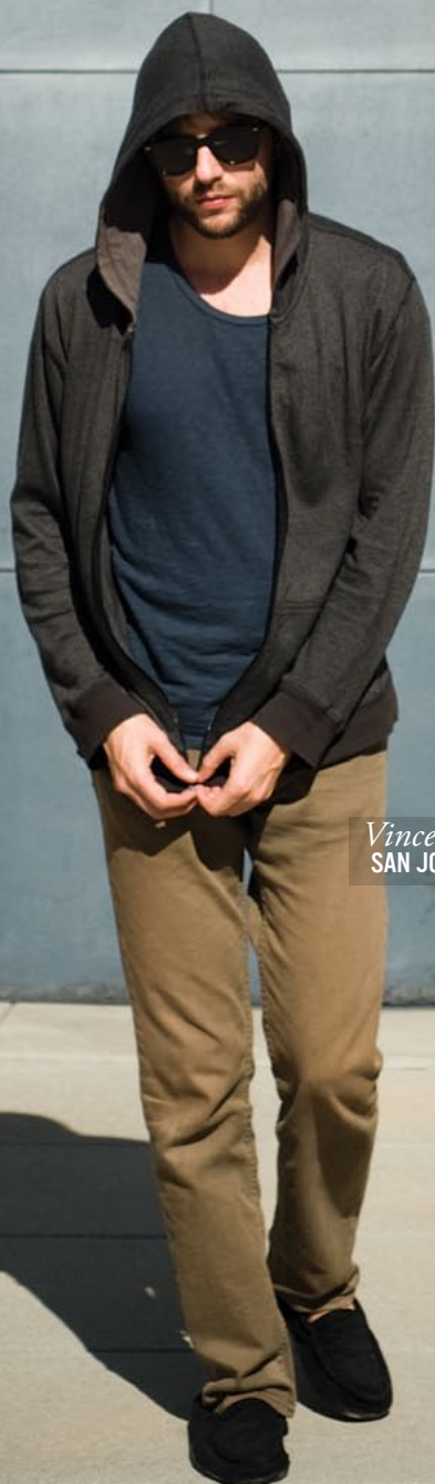
Vincent Kartheiser SAN JOSE REP THEATRE