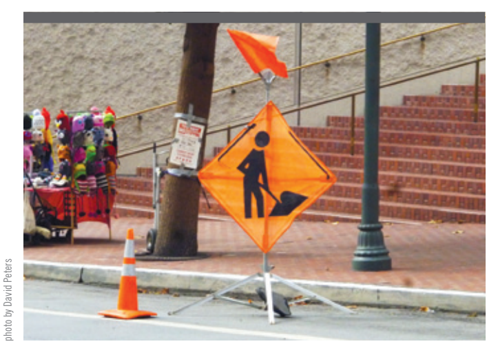
Prop. B includes funding for street repaving, traffic signal improvements and bicycle safety improvements.