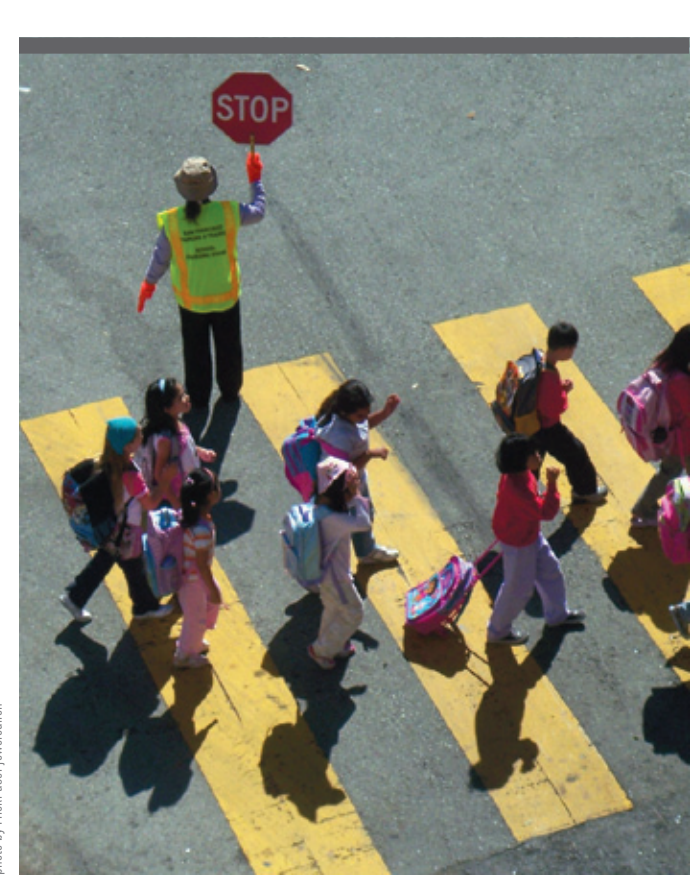
Prop. H supports the benefits of assigning students to neighborhood schools, including walking and biking to school.